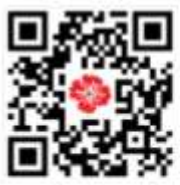
QR Code Buddy Poppy

Thank you, Dept. of Florida Auxiliaries, for your dedication, creativity, and unwavering support of our veterans, service members, and their families.